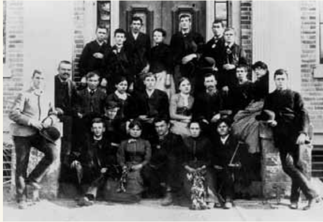
Seek ye diligently and teach one another words of wisdom; yea, seek ye out of the best books words of wisdom; seek learning, even by study and also by faith. Doctrine and Covenants 88:118

We invite you to EXPLORE this tradition of learning that seeks to educate the whole soul; DISCOVER the rich heritage of education in The Church of Jesus Christ of Latter-day Saints; BE INSPIRED by the stories of faith, sacrifice, and strength; and REFLECT upon your own commitment to lifelong learning as you spend time in the open gallery space.